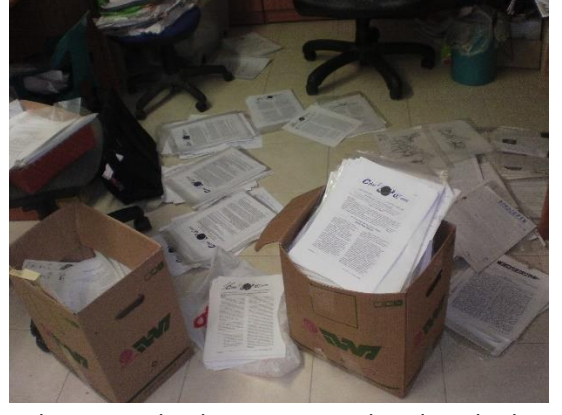
CyberCozen back issues sorted and packed

Following are some pics from before and during ICON.