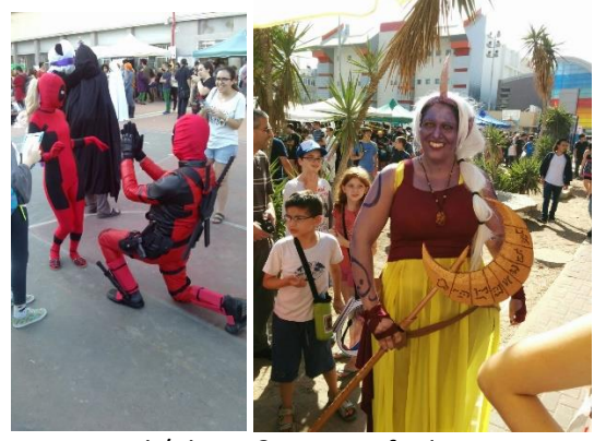
A proposal / dance? + A satisfied customer