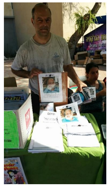
Your ever enthusiastic effervescent editor (with back issues + DVDs)