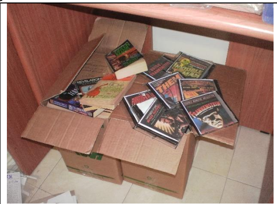
Books & DVDs ready to go